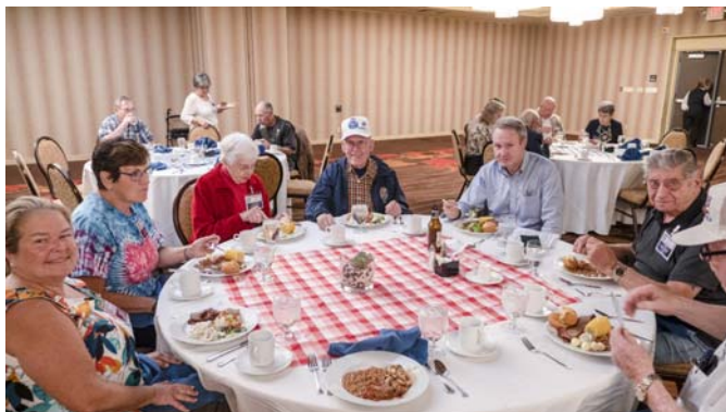
OPHSA enjoying the President's Reception Dinner