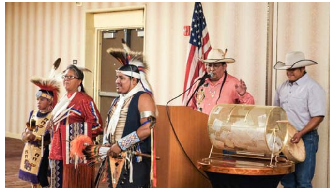
Taos Pueblo Indians performed traditional songs and dances