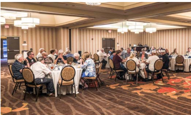
The Society of the 3rd Infantry Division at the President's Reception Dinner