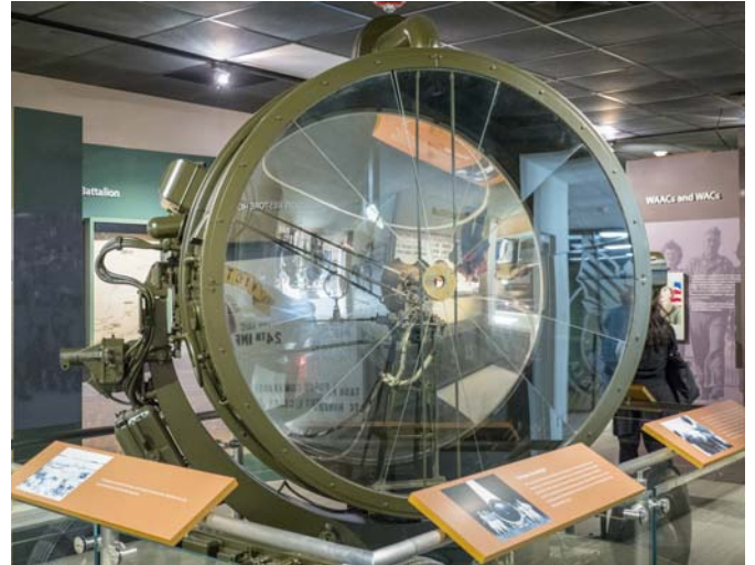
The "Moonlight" search light that lit up OP Harry -- from 10 miles to the rear