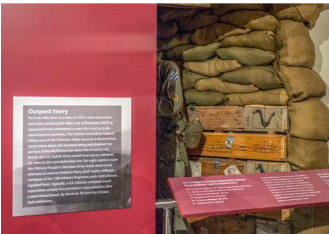
The Outpost Harry display