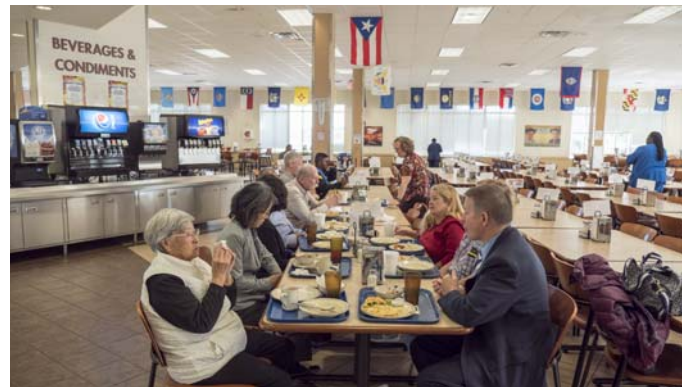
Lunch in one of Fort Stewart's "mess halls"