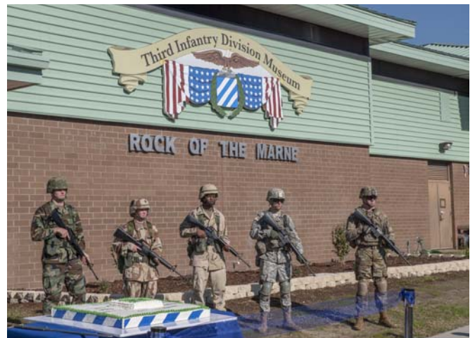
The ceremonial cake's guard? The un-cut ribbon in front