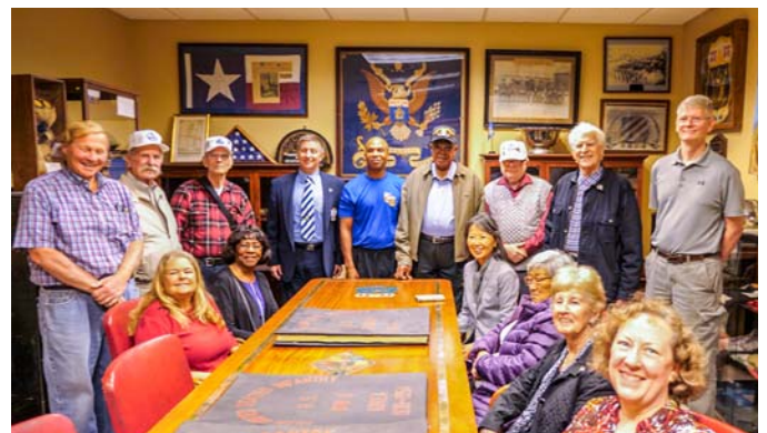
The 15th Infantry's China Room