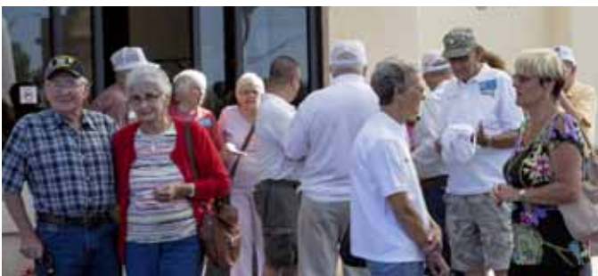
Waiting for the bus in front of the Hotel

Friday morning the group visited the Cowboy's Hall of Fame museum.