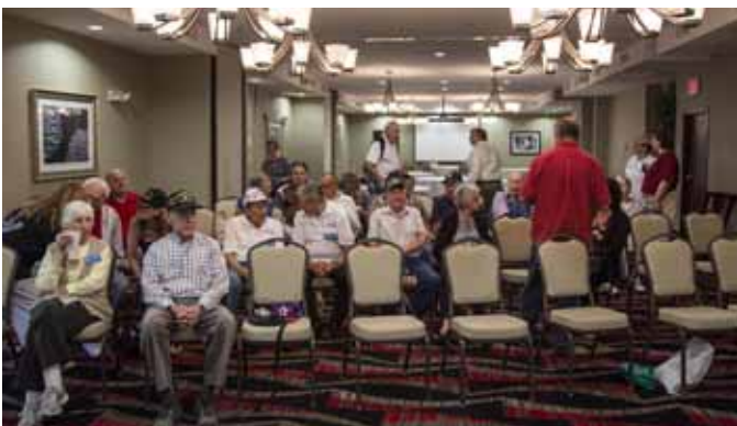
The Reunion Attendees gather for the memorial service

This year during this reunion the OPHSA memorial service was held honoring our fallen comrades.