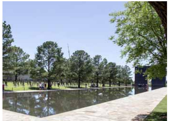
The reflecting pool where the building stood with the hillside behind the pool covered with memorials for each the people killed by the bomber - with a special section for the children killed in the ground floor nursery

The visit to the site of the bombing of the Oklahoma Federal building by an American terrorist was an extraordinary experience similar to visiting the site of the terrorist's attack on New York's Twin Towers.