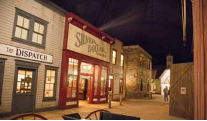
One of the many full-scale recreations of the frontier Oklahoma City in the museum