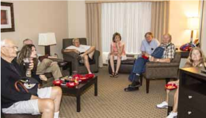
Watching the Hold at All Costs interview videos in the Hospitality room

The afternoon and evening were spent viewing the videos of the complete interviews made for the Hold at All Cost documentary.