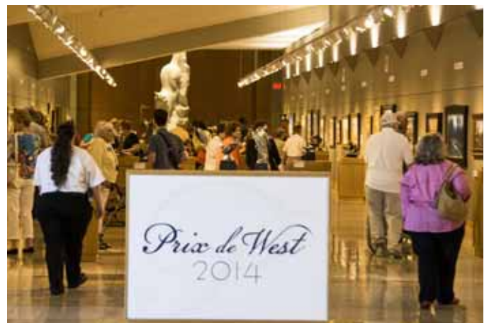
One of the many art exhibits in the Cowboy Museum

We were on an open schedule so we all were allowed the time to view the museum.