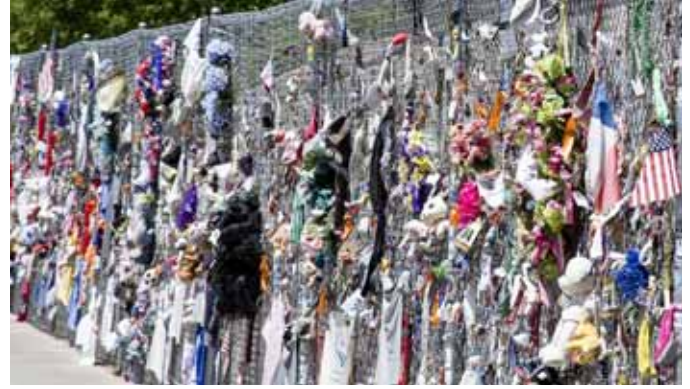
A fence, around the bombing site, with memorial mementos put there by the public