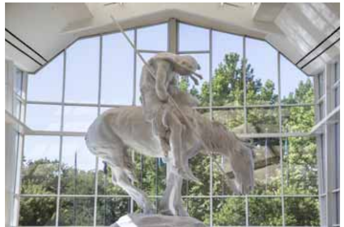
This iconic statue greeted us as we entered the museum

The museum was both a surprise and delight as it was an equal to any that we saw during our trip last year to Washington D.C.