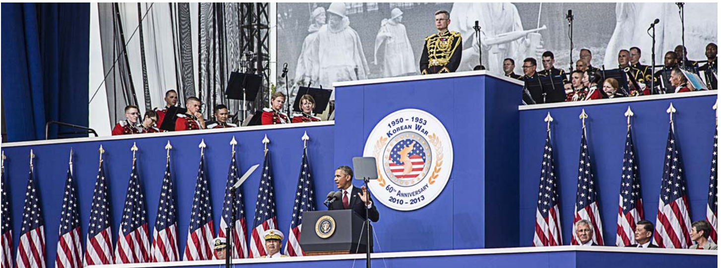
President and Commander in Chief, Barack Obama, speaking to the assembled Korean War Veterans

http://www.youtube.com/watch?v=fi-v4rYsRxk