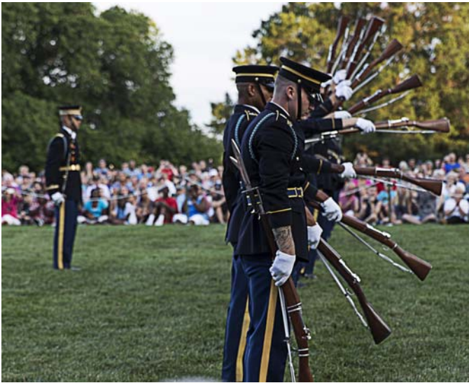
Precision Drill Team

Thursday morning the OPHSA group visited the Korean War Memorial.