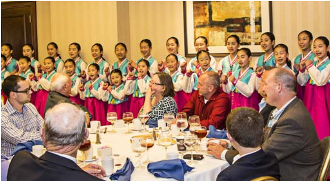
OPHSA Evening Banquet

The evening Banquet was held in the Marriott Hotel where we were entertained by the Korean “Little Angels” shown here performing Yankee Doodle