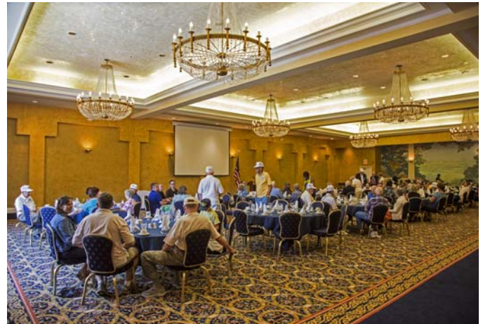
Lunch at the Meyer's Officers Club.