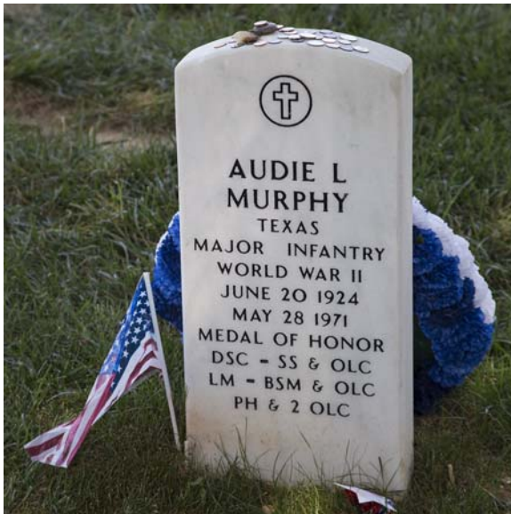
Audie Murphy's grave

While at Arlington National Cemetery, we also viewed Audie Murphy's grave.