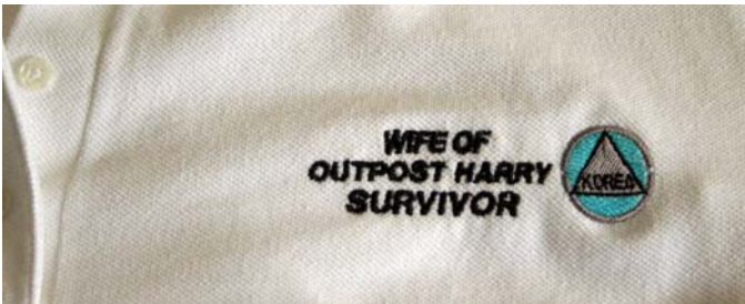
Ladies OP Harry shirt, left logo

Spouses and family members shirts have "Wife of Outpost Harry Member", "Son of Outpost Harry Member", "Daughter of Outpost Harry Member", etc. with the OPHSA emblem.