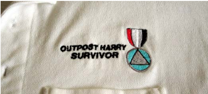
Member OP Harry shirt, left logo

Members shirts have "Outpost Harry Survivor" and the OP Harry Memorial Medal embroidered above the left pocket.