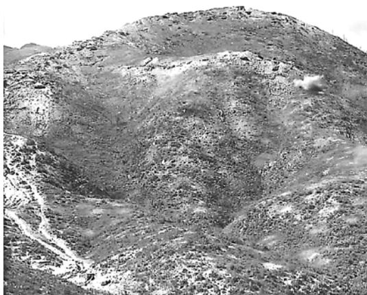
With Courage, Tenacity and Faith..... WE HELD!

The 21st Reunion of the Outpost Harry Survivors Association, will be held at Fort Benning GA from June 7th, 2012 to June 10th, 2012 at the Wyndham Garden Columbus Georgia hotel.