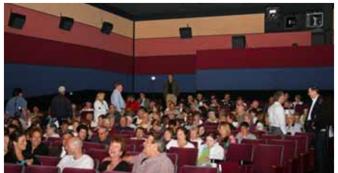
Audience ready for the showing