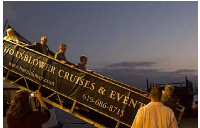
Disembarking the cruise ship