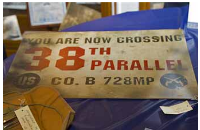
38th Parallel warning sign