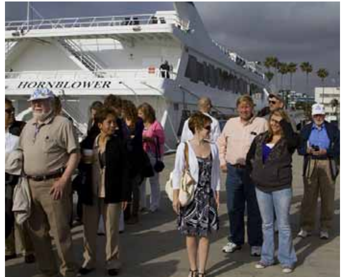
Loading onto the cruise ship for an afternoon voyage on the San Diego Bay