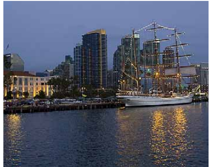
Coming into port