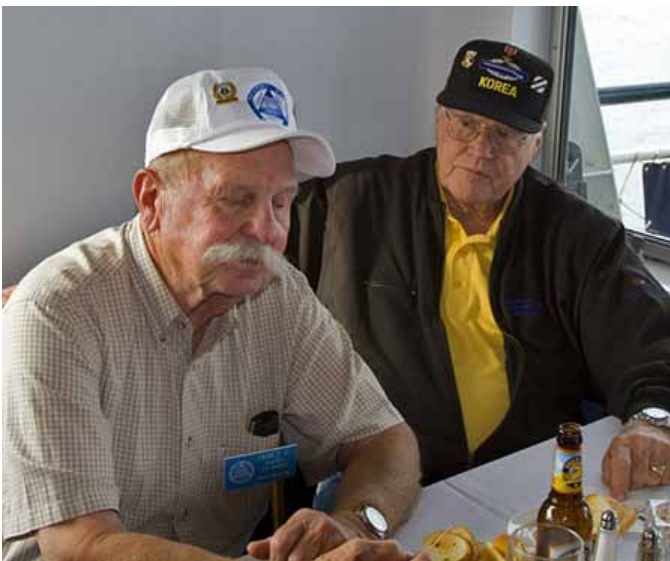
The Tankers Table