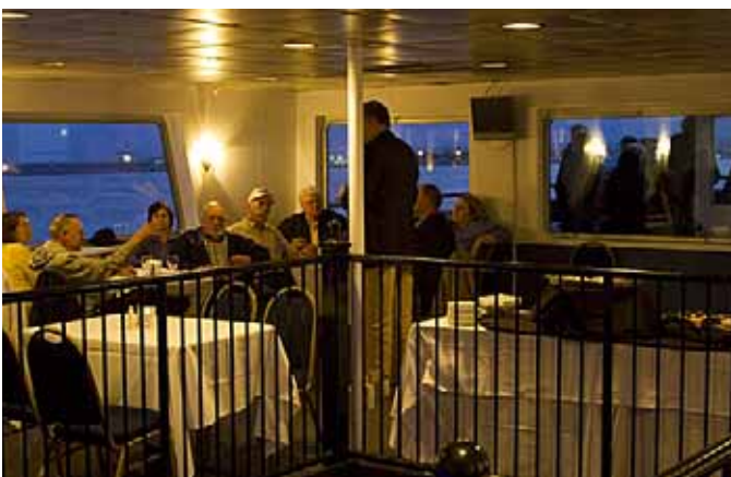
The party winds down