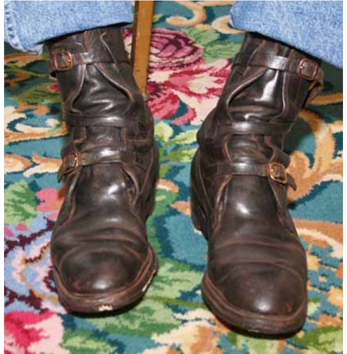
Hal's Tanker's boots