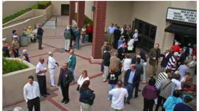
Entering the Hold at all Cost showing