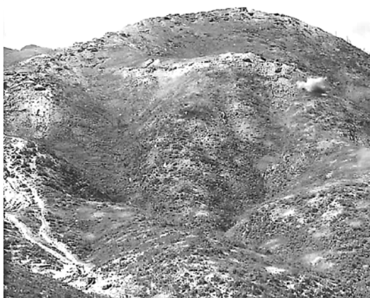
With Courage, Tenacity and Faith..... WE HELD!