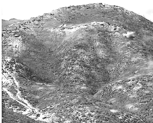
With Courage, Tenacity and Faith..... WE HELD!

The Hyatt Regency Dearborn Michigan hotel has been selected to host our 18th Annual Reunion to be held from June 11th to June 14th, 2009. The room rate is $103.00 Per Night. The hotel is accepting reservations now.