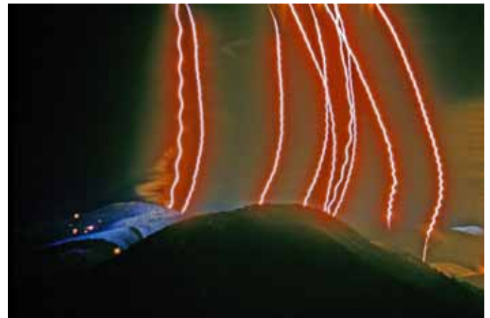
This time exposure was made during the night of June 15-16, 1953 from OP Howe. At the left is the Chinese “Star Hill” illuminated by “Moonbeam” (a 60 inch, parabolic lens, 800 million candlepower searchlight) Star is being hit by American mortar fire. The descending parachute flares silhouette the dark OP Harry atop the hill at center. These flares were fired by mortars at the direction of artillery forward observers located on the OP.

The Chinese attacked into an unbelievable, well-prepared maelstrom of artillery fire, mortar fire, direct and indirect fire from heavy machine guns and recoilless rifles from the MLR (main line of resistance). Huge carbon arc searchlights lit the Chinese avenues of approach and numerous parachute flares supplied additional lighting.